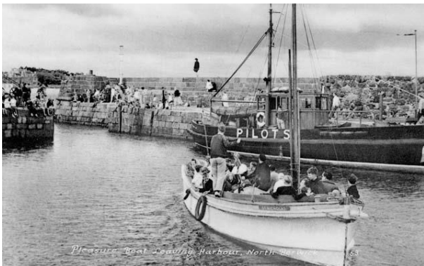
The St Baldred & St Nicholas pleasure boat trips were operational from North Berwick Harbour !

1) The Bass Rock, described as "one of the greatest wildlife wonders of the world" plays host to more than 150,000 gannets & is the world's largest colony of Northern gannets. Another famous "rock group", The Byrds, recorded their hit "Mr Tambourine Man" in this year.